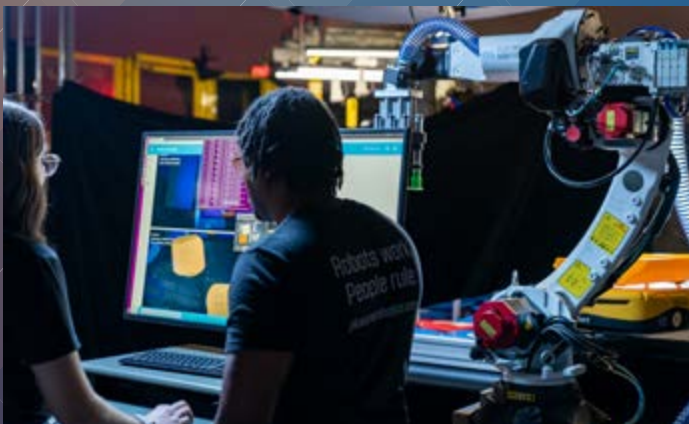
Plus One Robotics R&D laboratory.

SINCE LAUNCHING THIS VISION IN 2018, WE'VE CREATED OVER 8,000 NEW JOBS.