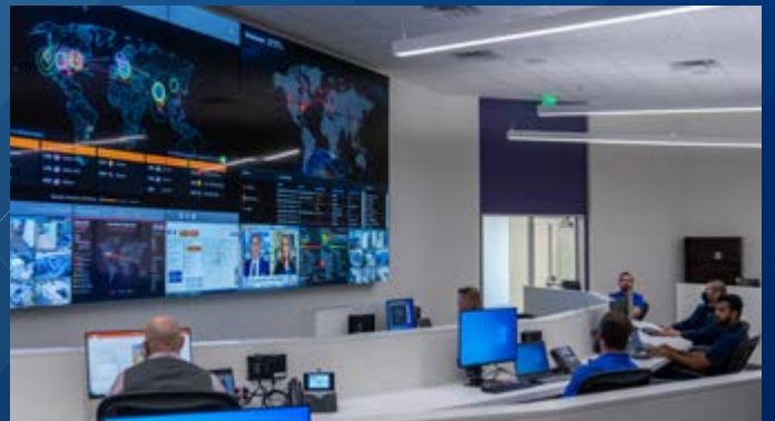
Alamo Regional Security Operations Center (ARSOC) strengthens around-the-clock collaboration between the city of San Antonio and CPS Energy information security personnel to safeguard the community's critical infrastructure against a growing threat environment.