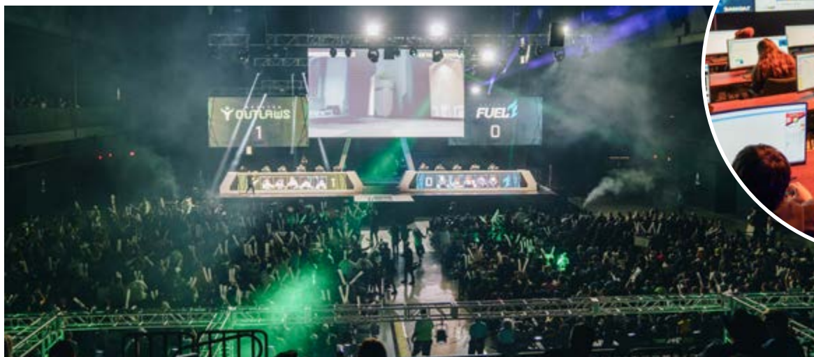
Above: The technology / esports arena at the Boeing Center at Tech Port.